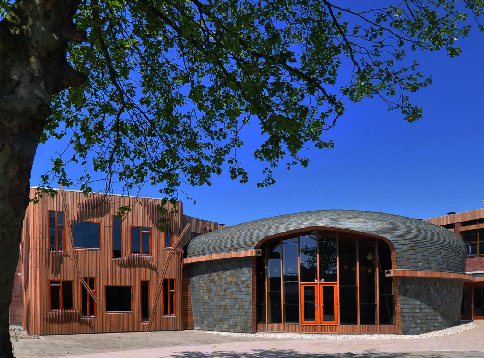
Marecollege, Leiden/Netherlands. (top) Rosewood Hotel, Abu Dhabi/United Arab Emirates (next page)

D o you have an interior or exterior project in mind? Any residential, shop-fitting or hospitality idea?