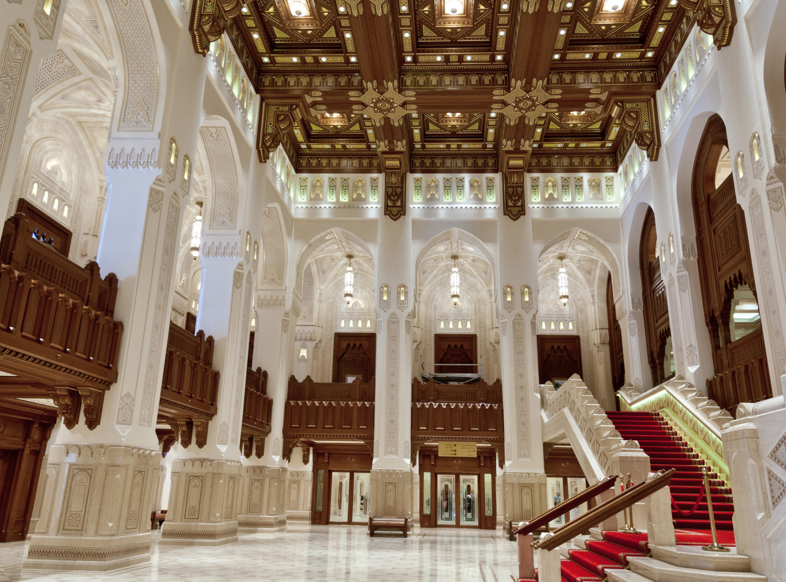
Royal Opera House, Muscat/Oman (top and left)